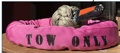
Optional protective sleeve