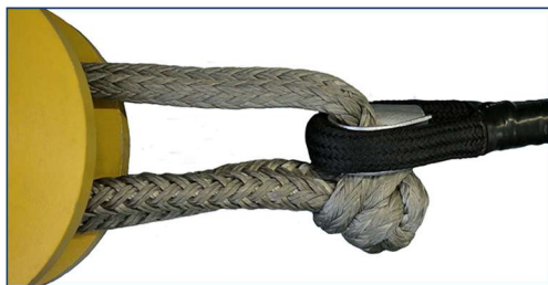
Correct connecting method