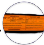
Traceable ID Tag